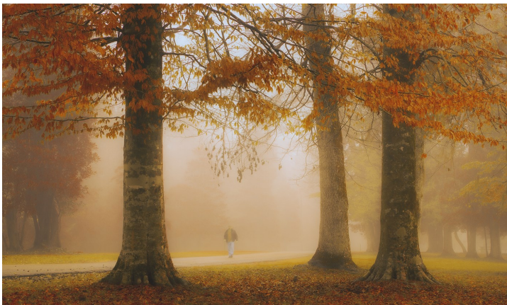
Morning Walk Among Giants