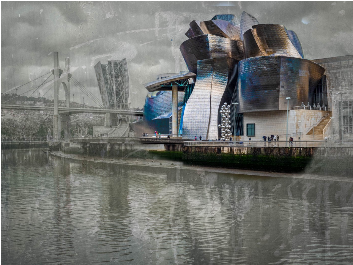
Guggenheim Museum, Bilbao