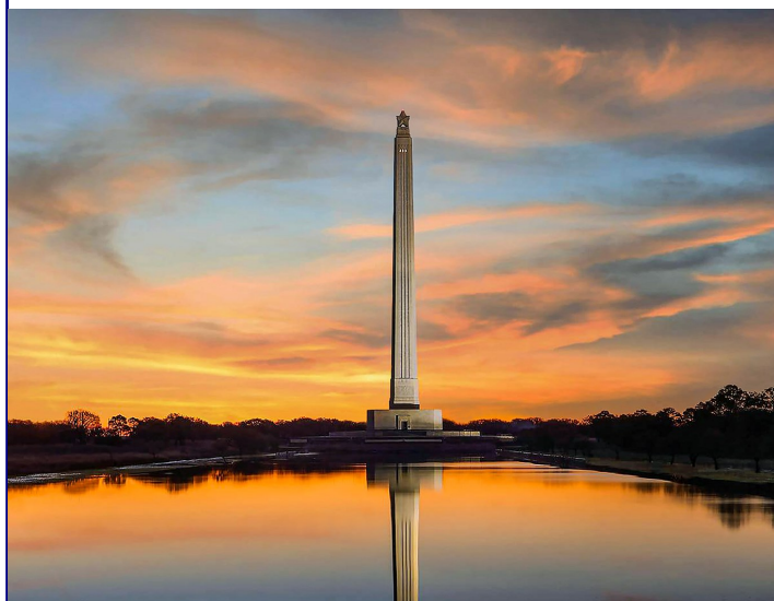
San Jacinto Monument