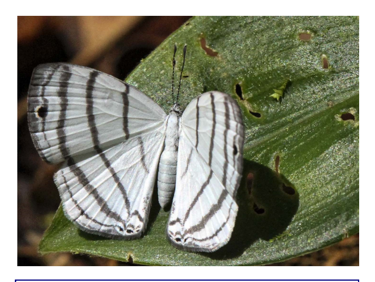
Cloudy Eye Whitemark, Leucochimona lagora By: Marcia Raskin

While it wasn't a photo workshop, many pictures were taken during the daily hikes of gardens, national parks, and lush rainforests. Costa Rica's iconic butterfly, the blue morpho, was elusive but there were many other beauties around. The glass wing was a favorite. A plus was a night-time black light set-up to watch and photograph many varieties of beautiful moths.