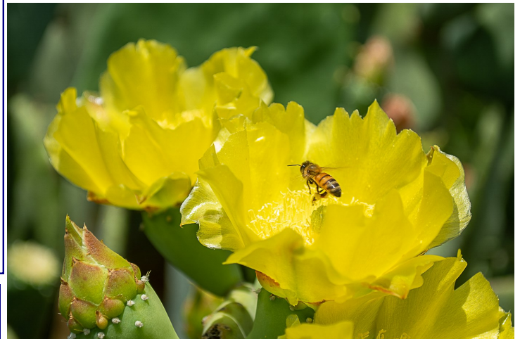
Bee On Cactus