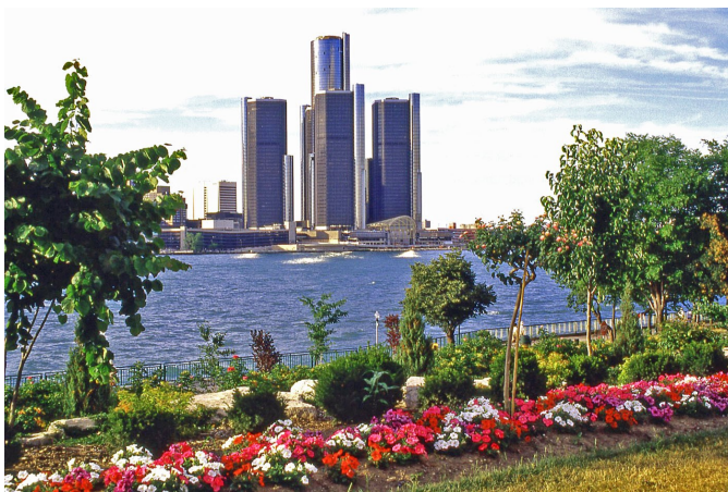
Detroit From Canada