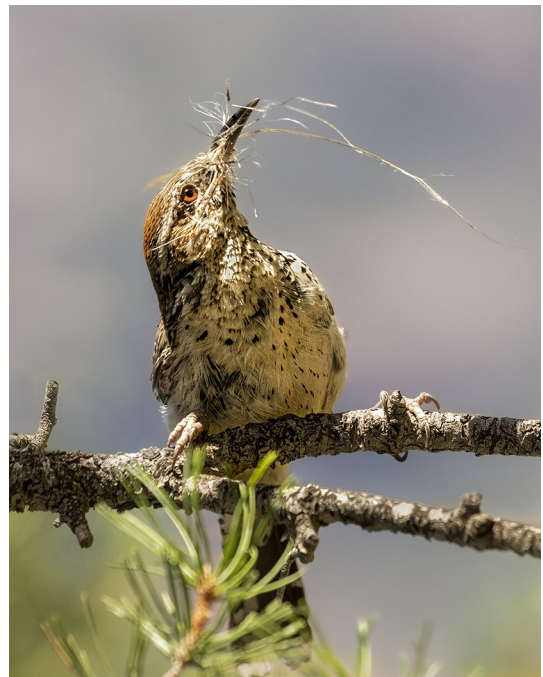
Gathering Nest Material