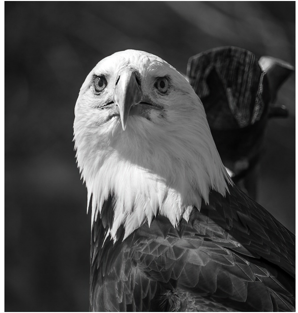
What Are You Looking At