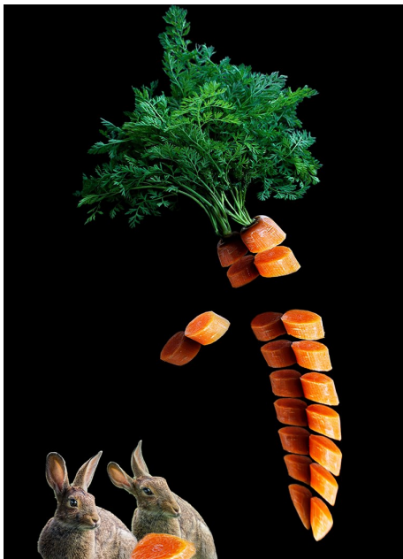
What's Up Doc