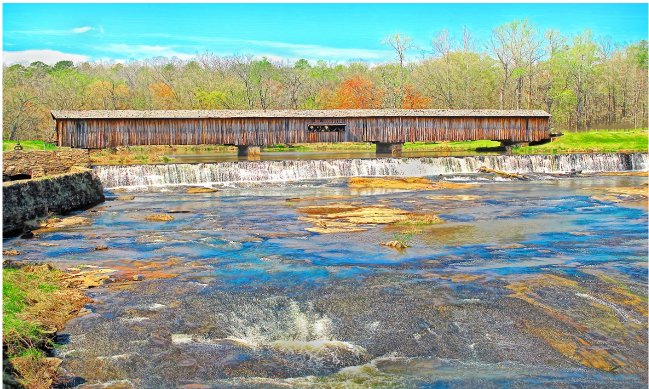
Watson Mill Bridge