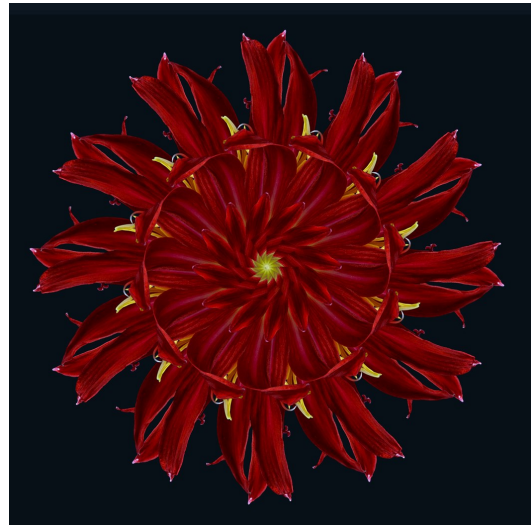
Red Lily Design By: Buz Cabral