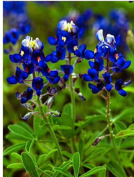
Three Bluebonnets By: Charles Edwards