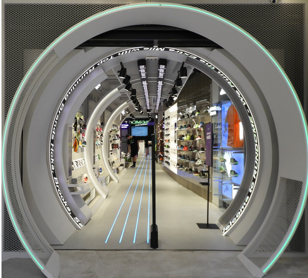
Tunnel Vision By: Bill Dupré