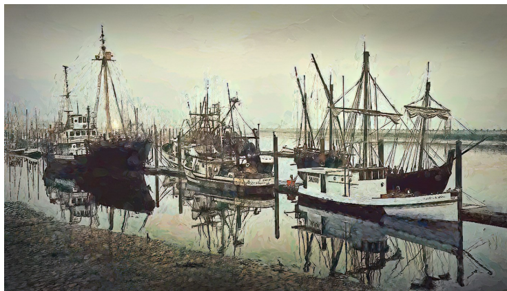
Newport OR Fishing Boats