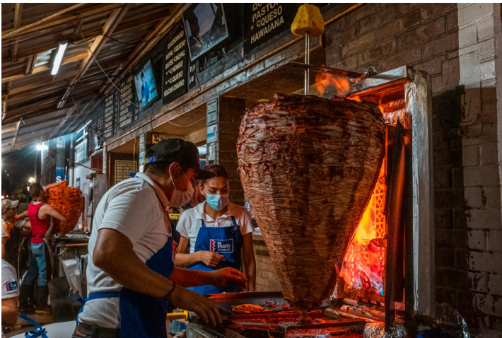
Mexico Food Street