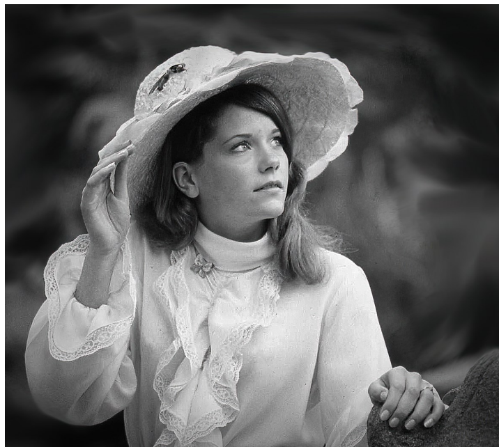
Straw Hat Portrait