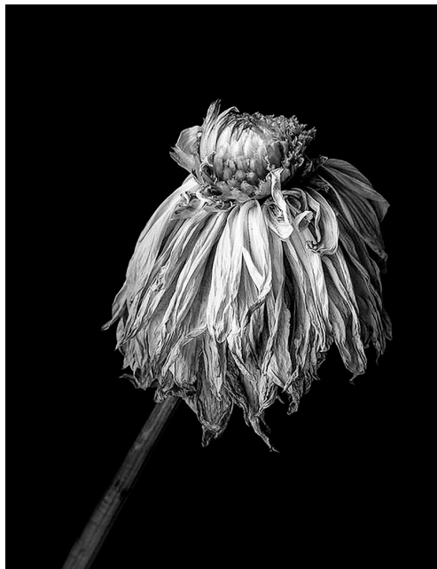
Aging With Dignity