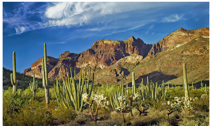
Organ Pipe NP