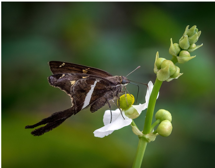
Long Tailed Skipper

You may submit one print. Pictorial print rules apply. Images are limited to 8 1/2" by 11" in size.