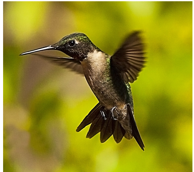
Ruby Throat Hummingbird