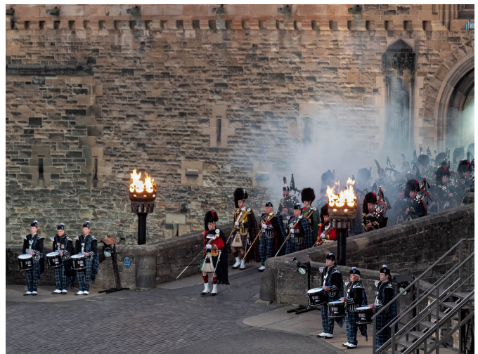
Royal Military Tatoo