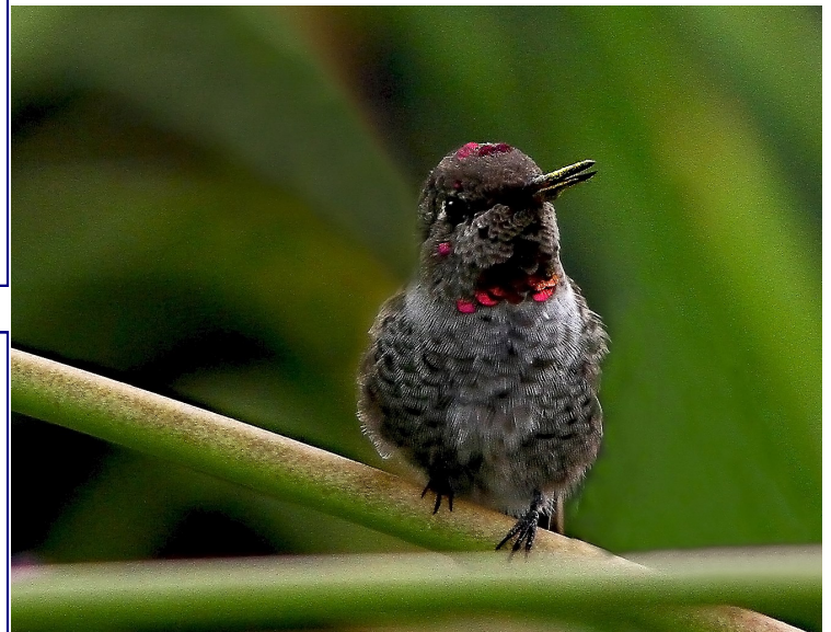
Hummingbird Likes Pollen