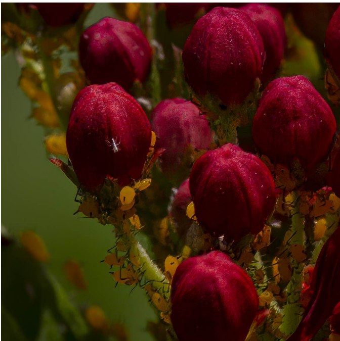
Infestation

The Rangefinder is a publication of the Houston Camera Club, Houston, Texas. www.houstoncameraclub.org