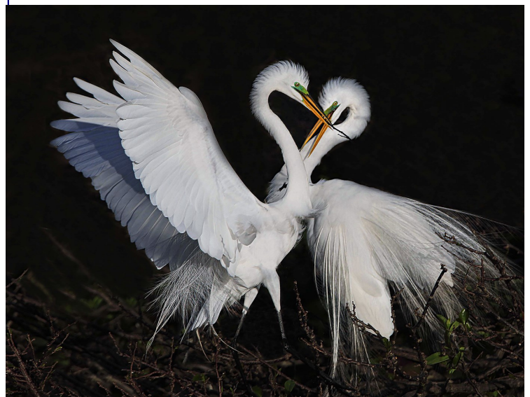
Stick For My Lady's Nest