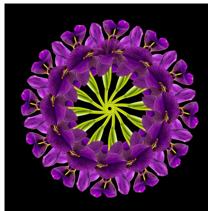
Violet Wreath By: Buz Cabral