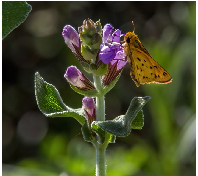
Yellow Skipper By: Buz Cabral

The Rangefinder is a publication of the Houston Camera Club, Houston, Texas. www.houstoncameraclub.org