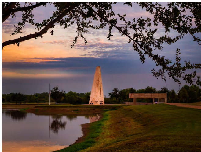
Veteran's Memory Park

Members of HCC have been to a number of GSCCC Conventions. The pricing is reasonable, the events are fun and interesting, the speakers are knowledgeable, and there are lots of friendly people interested in photography. What more could you want? You will not be disappointed if you decide to attend.