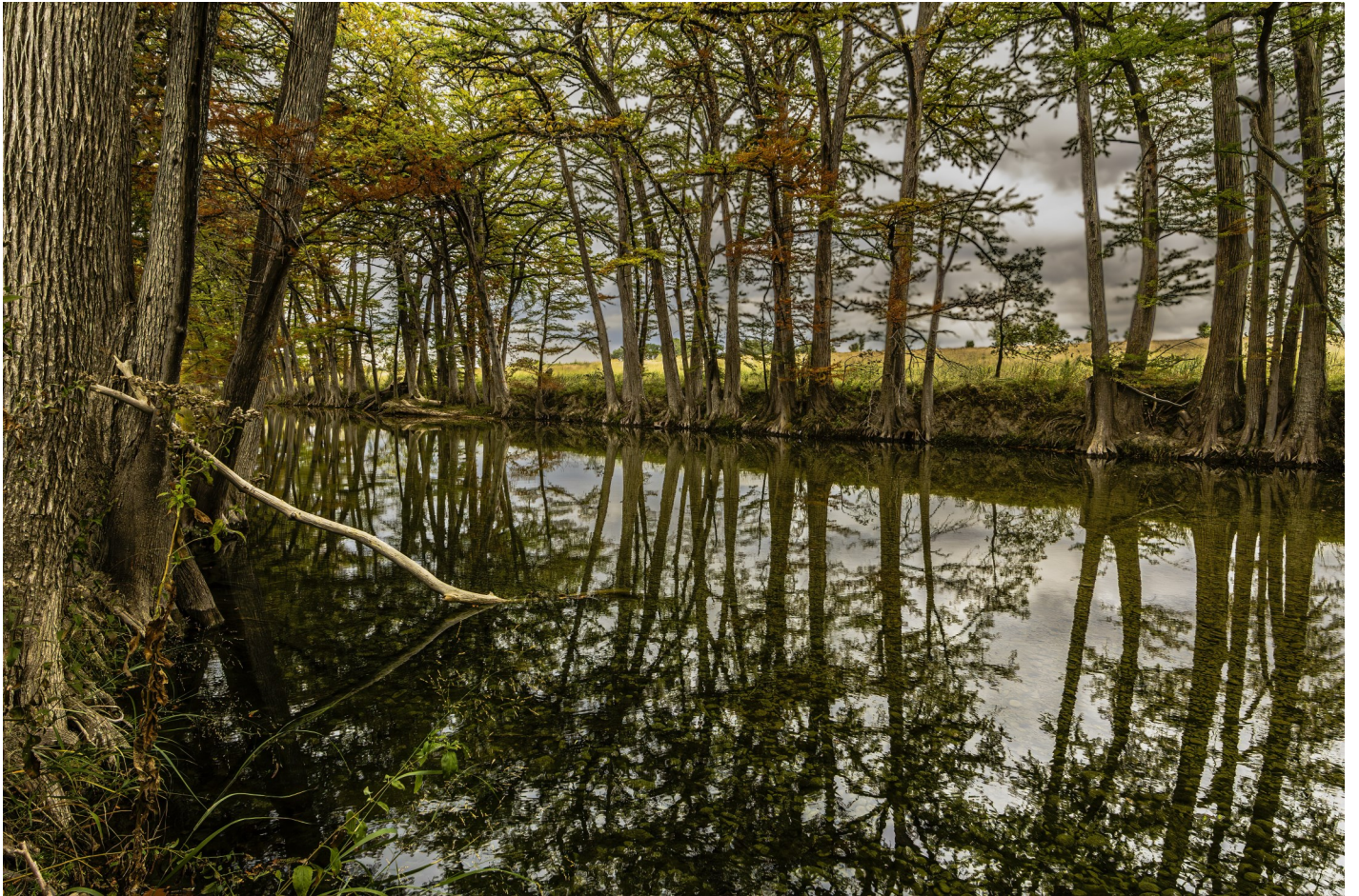
Can Creek, Vanderpool Texas