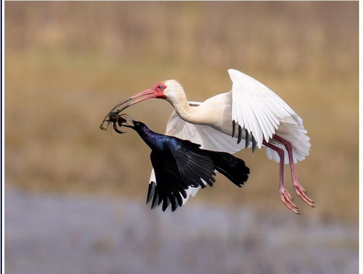
Grackle's Attempt To Steal

The Rangefinder is a publication of the Houston Camera Club, Houston, Texas. www.houstoncameraclub.org