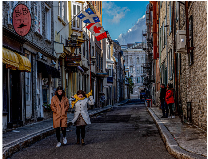
Quebec Street Scene