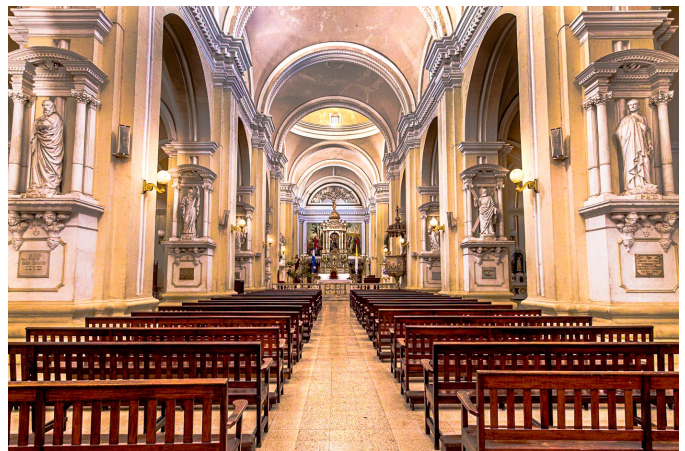
A_León Nicaragua Cathedral