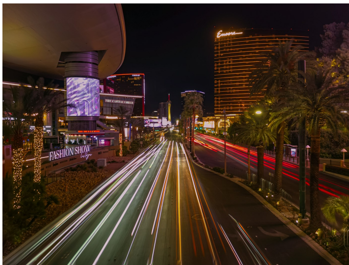
Vegas Light Trail