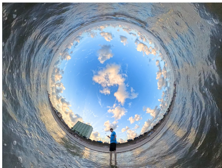
Water World Pano