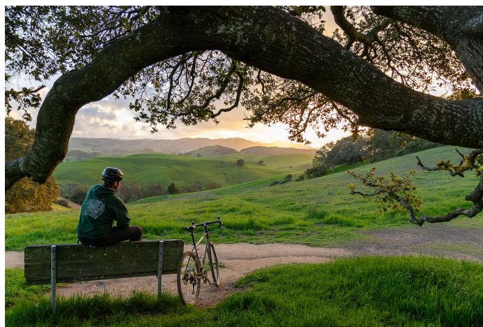
Taking It All In