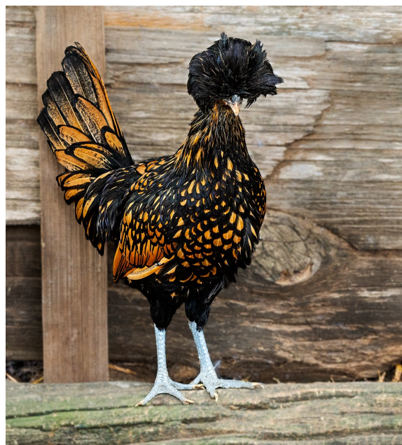
Elvis Has Left The Building