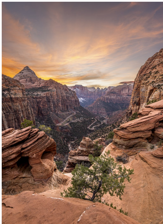
Sunset Over Zion

Winner Looking Up At Pole Vaulter M. Holloway