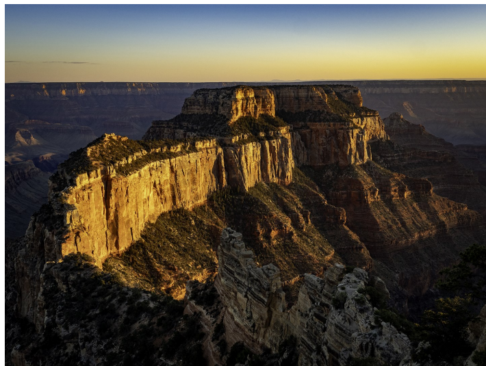
Grand Canyon North Rim Sunset

Year-end results will be announced and awards presented at the annual awards banquet, August 18 .