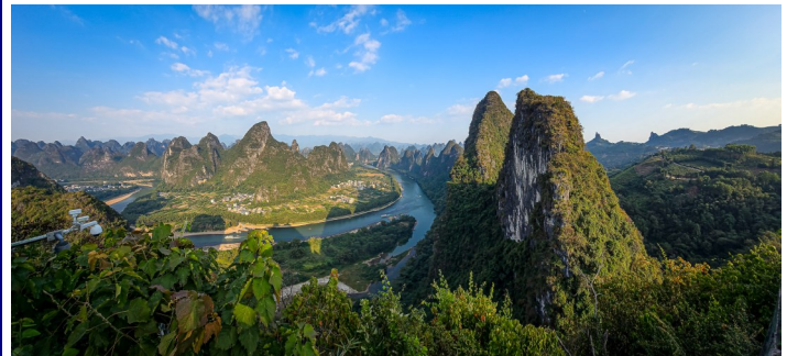
Sunset Karst Guilin China