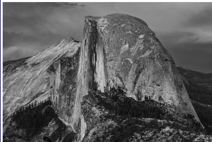
Majestic Half Dome